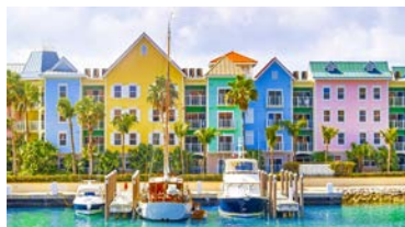
13 DAYS | ISLAND ODYSSEY: BAHAMAS TO THE GRENADINES Nassau > Bridgetown October - November 2024