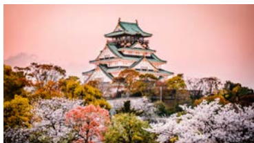
15 DAYS | NATURAL WONDERS OF JAPAN AND TAIPEI Osaka > Taipei June 2025