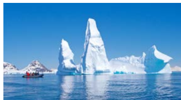
20 DAYS | ANTARCTICA, SOUTH GEORGIA & THE FALKLAND ISLANDS Buenos Aires > Buenos Aires January - February 2025